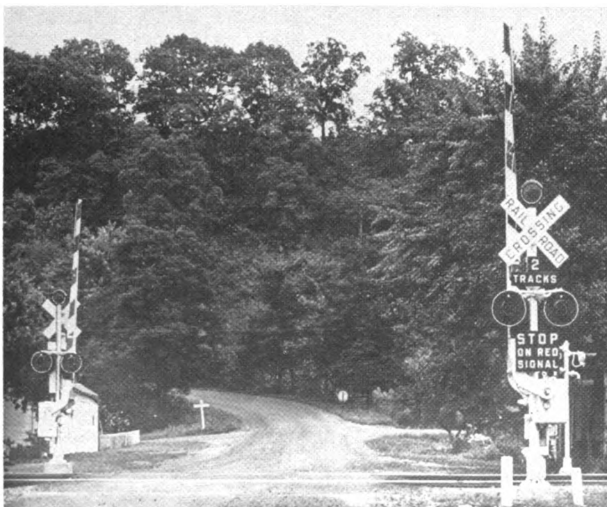
Neon-lighted automatic gates and associated flasher signals in Lucasville, Ohio

These gates and flashers with the neon lighting on the gate arms have been installed by the regular signal construction forces of the Norfolk & Western.